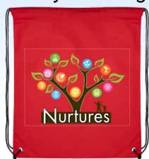
Family Pack Bag

Student can re-use their bags to take activities home