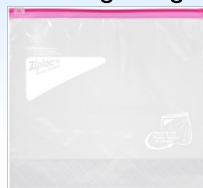
Sealable Storage Bag

Activities should be packed in storage bags to make pack bag refills easy